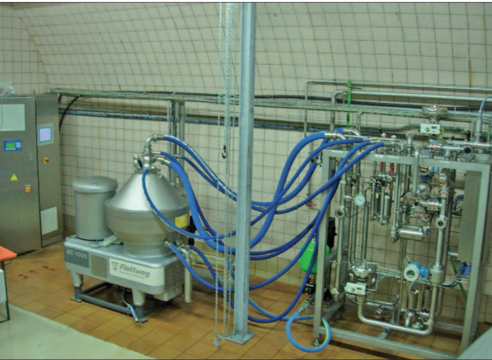
Test installation: Disc stack centrifuge with connection frame.

Due to the excellent results in the tests the disc stack centrifuge was already during the second week completely integrated into the filtration process. Besides the experienced technicians, there was always a process engineer at their disposal during the whole test period.