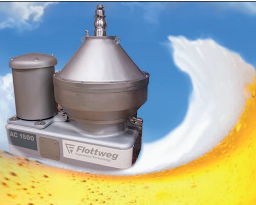
The new Flottweg beer separator AC 1500-420 provides longer filter service life for the Apolda brewery.

The AC 1500-420 clarifier, with a bowl volume of 14 litres and a maximum bowl speed of 6800 rpm, can process a quantity of 50 to 130 hl/h. A low maintenance belt drive efficiently transfers the power to the clarifying bowl.